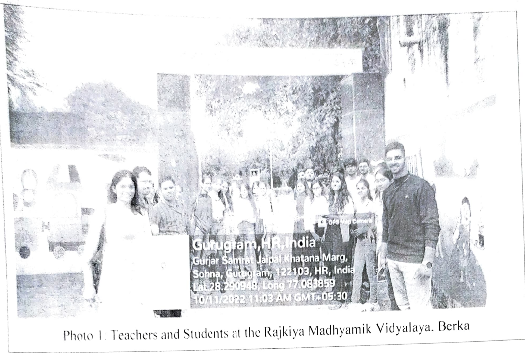
Photo 1: Teachers and Students at the Rajkiya Madhyamik Vidyalaya. Berka